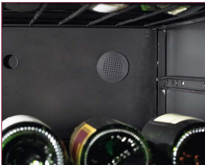
Activated charcoal filter